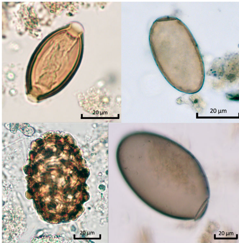
Fig. 3. Parasite eggs from the cesspits at Aalst. Top left whipworm (dimensions 55 × 25 µm), top right Dicrocoelium liver fluke (40 × 21 µm.), bottom left roundworm (69 × 40 µm), bottom right Echinostoma sp. (118 × 69 µm).