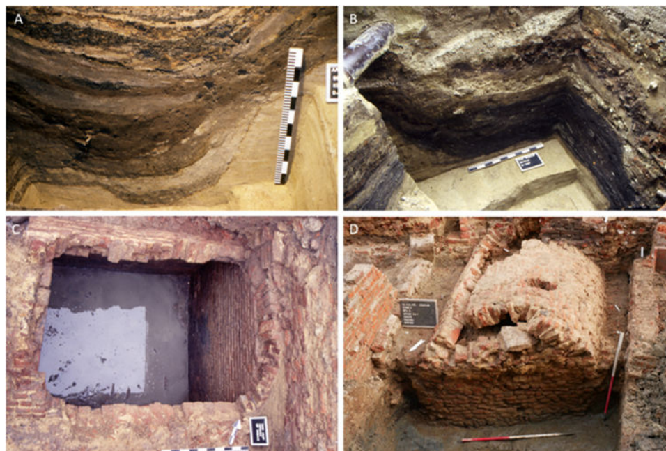
Fig. 2. Examples of Aalst cesspits at excavation, showing serial layers of deposits. A) cross section of unlined cesspit E from Stadhuis (1100–1225 CE); B) unlined cesspit I from Stadhuis (1225–1300 CE); C) brick lined cesspit XIV/BA6 from Hopmarkt (1400–1500 CE); D) brick lined cesspit 2 from Molenstraat (1500–1600 CE).

Here, we use the colloquial term parasites to denote the taxonomic groups helminths (worms) and single celled protozoa. In archaeological samples, the eggs of helminths can be identified and quantified using light microscopy. In contrast, intestinal protozoa that cause dysentery reproduce via cysts or oocysts, which are fragile and deform in